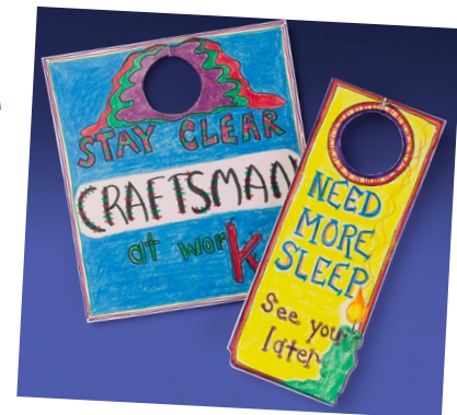
Dad's Door Knob Hangers